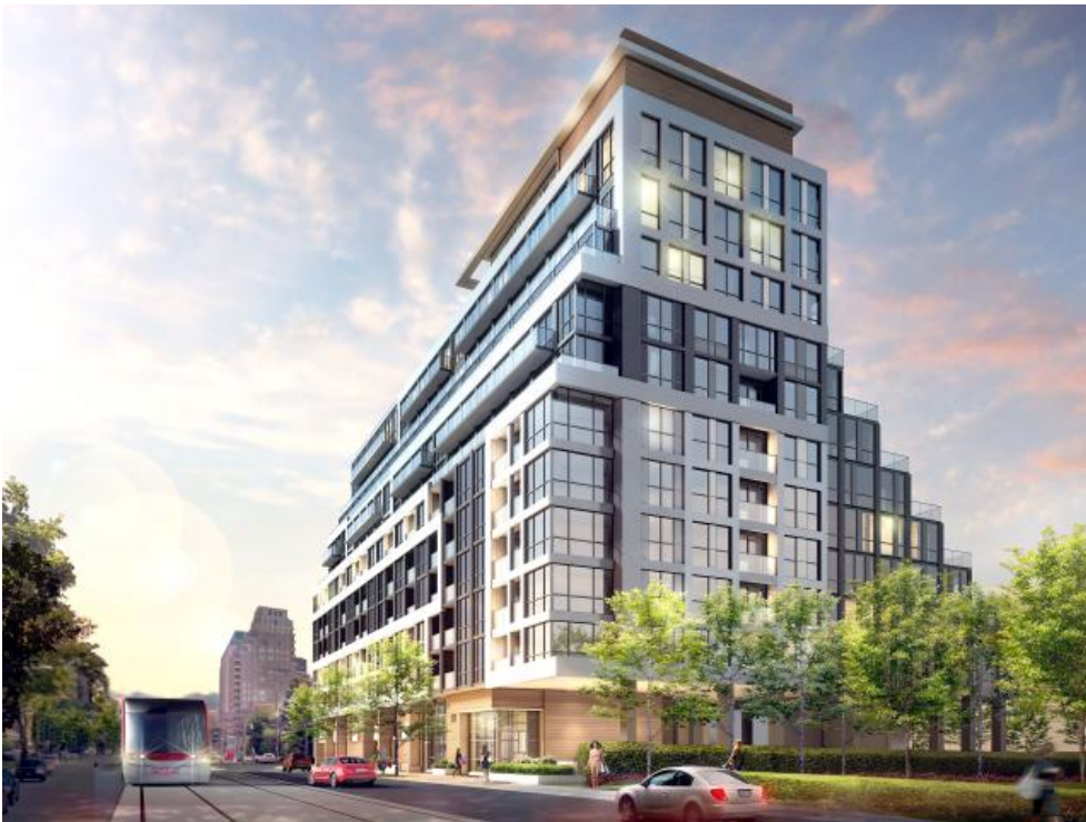
St. Clair Avenue view of ZIGG Condos, image courtesy of Madison/Fieldgate

Transit is an important factor in spurring intensification, with new developments being built in growing numbers on or around existing transit infrastructure. Rapid transit lines like the Sheppard subway have been instrumental in attracting large-scale redevelopment projects, though intermediate capacity lines like the dedicated streetcar right of way on St. Clair Avenue West are also triggering growth. On St. Clair west of Avenue Road, Madison Homes and Fieldgate Homes' ZIGG Condos will be a notable addition to the neighbourhood, bringing increased density to a block currently occupied by single-family homes.