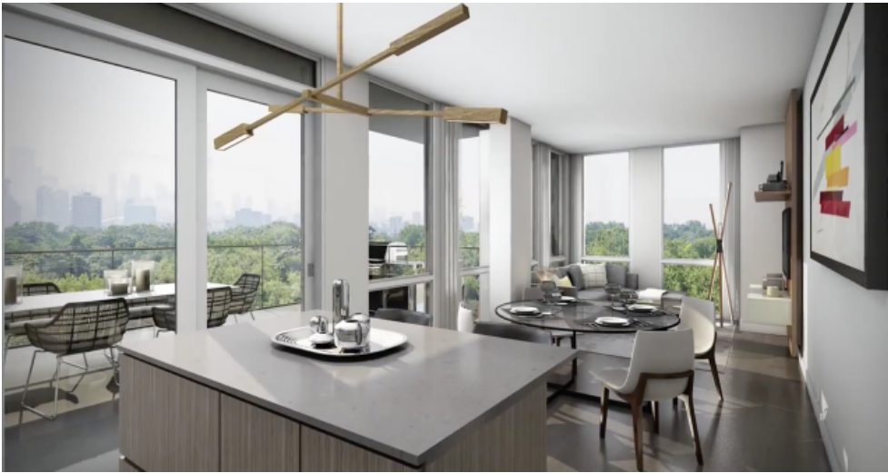
Interior view of suite at ZIGG Condos

In addition to the convenient neighbourhood amenity residents will find in transit accessibility, residents will also enjoy a collection of amenity offerings, appointed by The Design Agency . Several of these spaces will be located on the building's ground floor, including a dining room with kitchen and suspended fireplace, a private fitness centre, a multi-purpose party room with lounge seating, a bar, billiard table, and large-screen TVs.