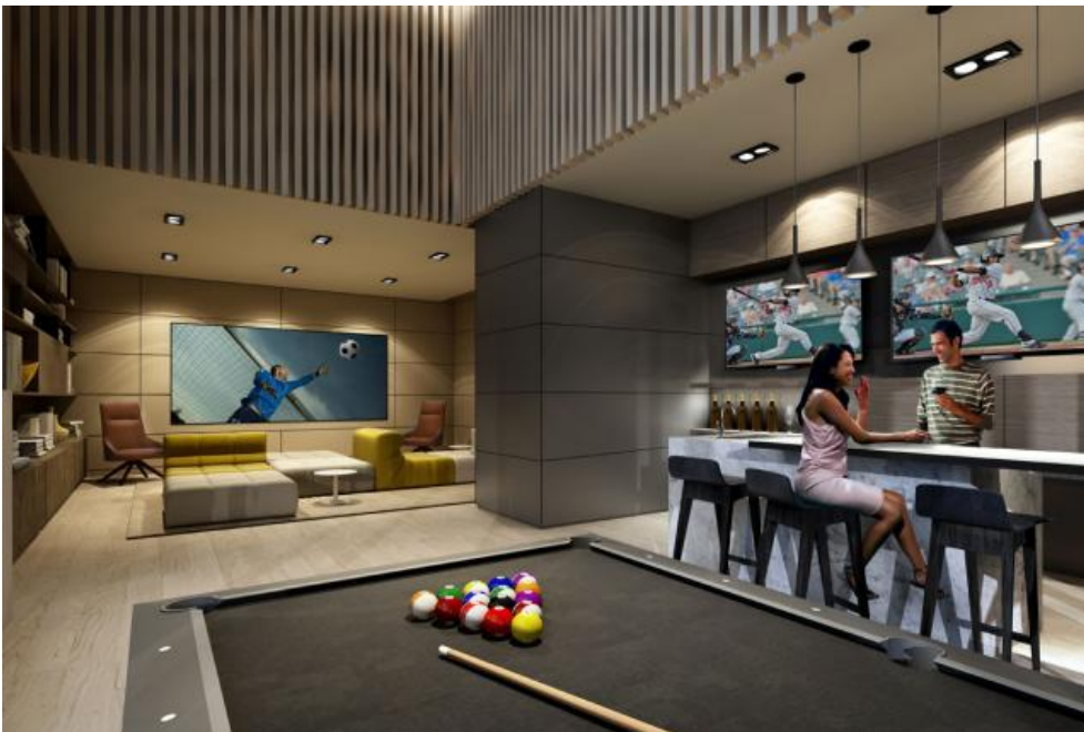
Party room at ZIGG Condos

The media lounge, games area and party room bar—labeled 7, 8 and 9 on the diagram above—are depicted in the rendering below, providing a taste of the space's engaging design, which like the other amenities at ZIGG, has been handled by The Design Agency .